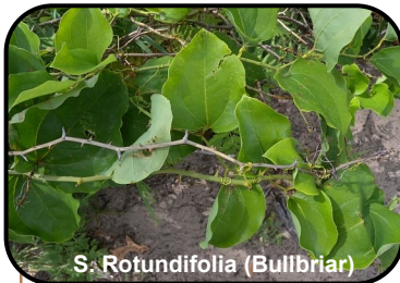
S. Rotundifolia (Bullbrier)

There are 12 species of Greenbrier ( Smilax sp. ) found in Florida. Though the species are difficult to distinguish from each other, the majority of them have woody stems and rhizomatous roots; spread via subterranean runners; climb using tendrils; and have sharp prickles on the stems.